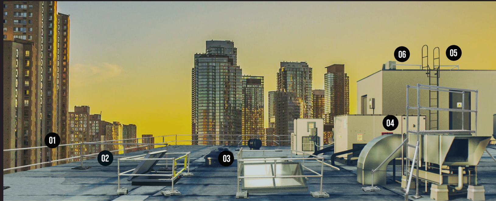
01 ROOFGUARD CLASSIC GUARDRAIL